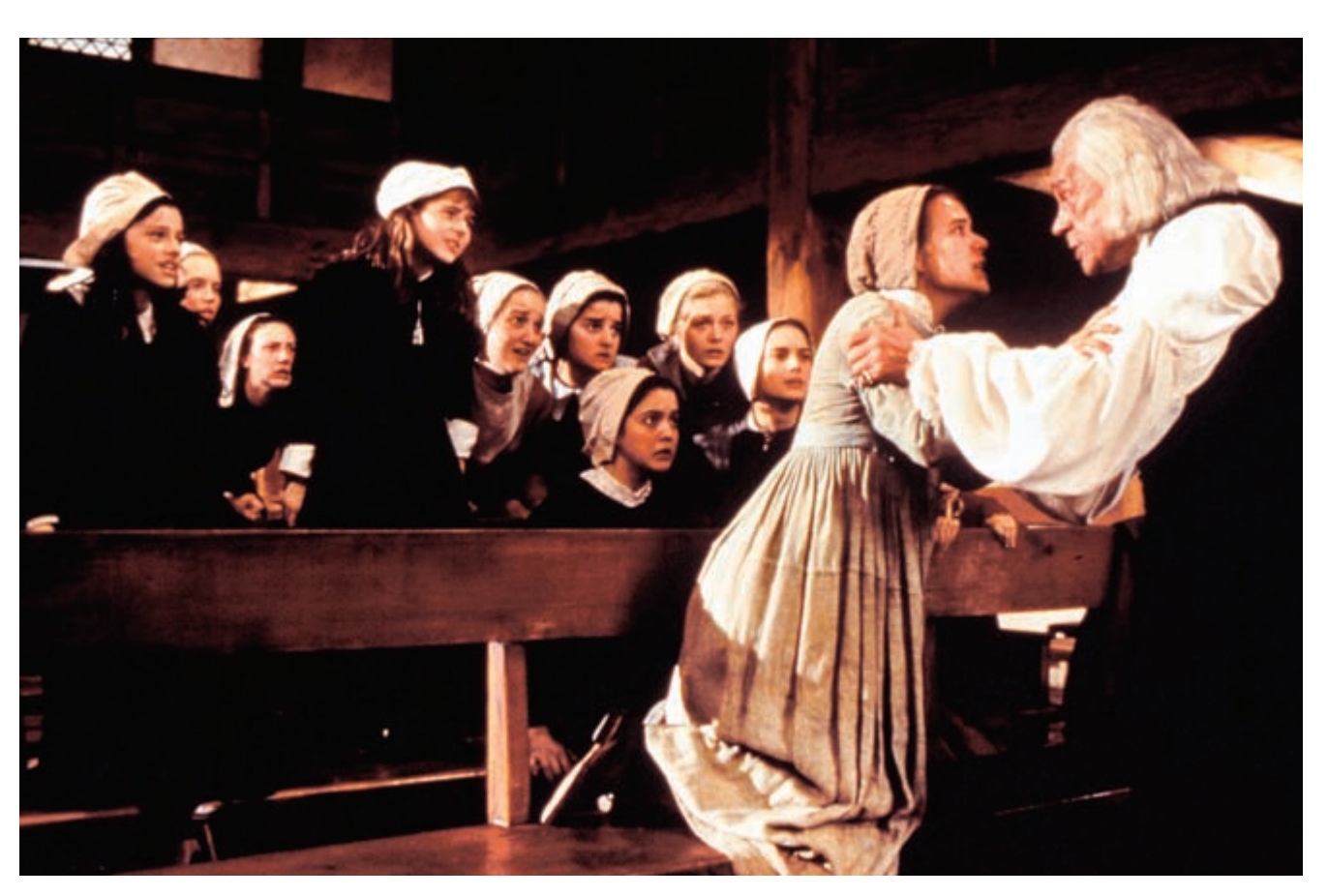
Judge Danforth questioning Mary Warren

Danforth. How were you instructed in your life? Do you not know that God damns all liars? ( She cannot speak. ) Or is it now that you lie?